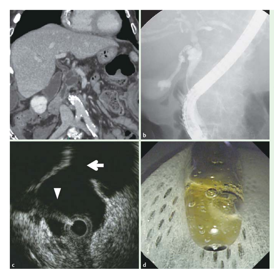
Fig.2 a Computed tomography (CT) image showing a cystic lesion with multiple septa in the pancreatic head. b Endoscopic cholangiogram revealing a dilated biliary tree in which the mid common bile duct (CBD) has an extensive filling defect. c Intraductal ultrasonography (IDUS) showing a pancreatobiliary fistula. The white arrow shows the pancreatobiliary fistula. The white triangle shows the CBD. d Thick mucus plugs occluding the endoscopic nasal biliary drainage (ENBD) tube.