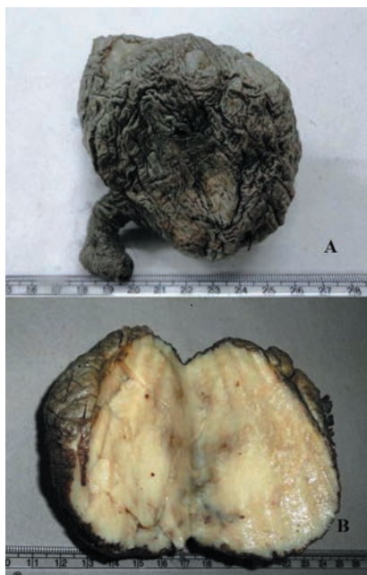
Figure 1. A) Skin covered soft mass with a short stalk; B) Mass showing solid, grey-white glistening and myxoid cut surface.