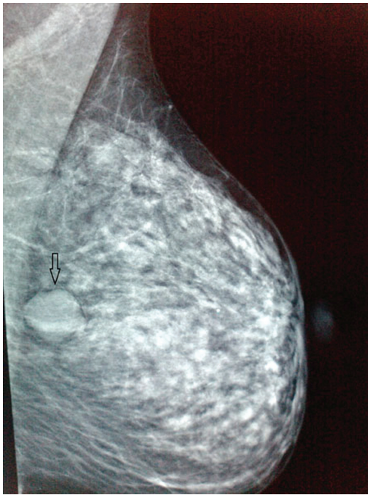
Figure 1. Left mediolateral oblique mammogram shows a multilobulated, well-circumscribed mass without calcifications, suggestive of a fibroadenoma.