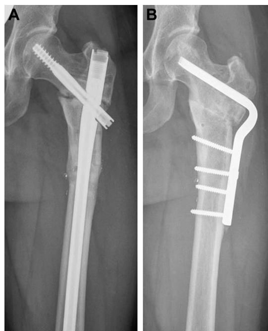
Figure 1 Perioperative X-rays of a femoral non-union.

Out of this non-union register, 20 patients were matched into pairs (Figure 2): 10 patients received ABG plus BMP-7 (G1) and 10 patients received ABG transplantation alone (G2). Specific matching criteria were “smoking”, as it is known for its impact on bone healing, 1 fracture location (tibia or femur) and gender. Subordinated criteria in our matched pair analysis were age and body mass index