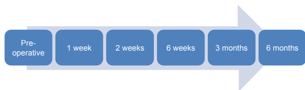
Figure 3 Timeline of sample acquisition according to a standardized cytokine protocol.

of time were expressed as absolute mean concentrations \pm standard deviation.