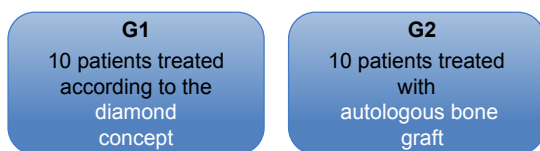
Figure 2 Groups of matched patients: G1 – treatment with BMP-7 and autologous bone graft (ABG) according to the diamond concept, G2 – treatment with ABG alone.

(BMI). The patients' smoking status was defined by their cotinine status and a questionnaire. The cotinine status was measured according to the standardized procedure of the manufacturer (Cotinine Direct ELISA Kit; Nal Von Minden, Maarn, the Netherlands).