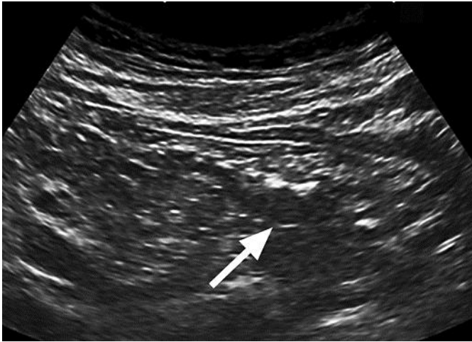
Fig. 3. Abdominal ultrasound image 15 days after onset. Unilateral wall thickening was seen in the jejunum (arrows).