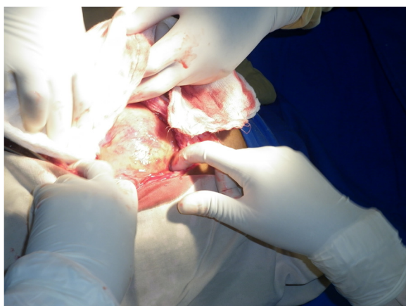
Fig. 1 Intact amniotic membrane

Her fallopian tubes, ovaries and other abdominal organs were normal. The amniotic sac was attached to her bowels and her anterior abdominal wall and this was removed intraoperatively with no abdominal organ damage. There was significant bleeding after the placenta was detached from her uterus which prompted total abdominal hysterectomy to secure hemostasis and to remove the ruptured uterus. Total estimated intraoperative blood loss was 2L. She was transfused with two units of whole blood intraoperatively and postoperatively and her post-transfusion hematocrit was 27% (Fig. 3).