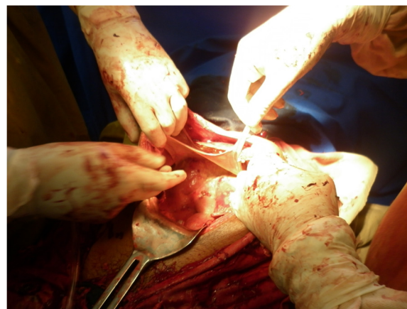
Fig. 3 Amniotic membrane attached to the bowel and anterior abdominal wall

Advanced abdominal pregnancy (AAP) is classically defined as a pregnancy that has progressed beyond 20 weeks of gestation in which the fetus is growing and developing in the mother's abdominal cavity, or the fetus shows signs of having been in the mother's abdominal cavity [6]. It is an extremely rare obstetric complication with high maternal and perinatal mortality. A review of cases from 2008 to 2013 showed that 38 cases of an AAP resulting in a live birth were identified from 16 countries [7].