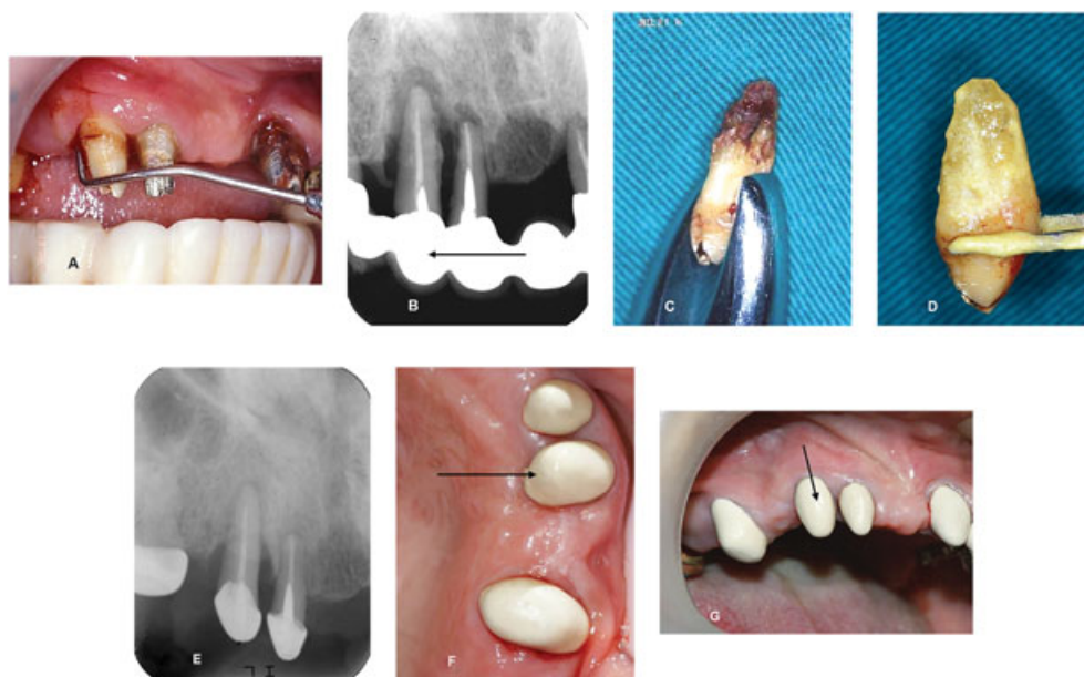
Figure 2. (A) Clinical probing depth >10 mm was found at the distopalatal area of tooth #13. (B) Complete bone loss was extended to the root apex of teeth #13 and #12. (2007) (C) Heavy calculus deposits were noted surrounding the apical third after extraction of tooth #13. (D) Immersion of tooth #13 in minocycline-HCL paste for 5 min after thorough scaling and root planing. (E) Periapical radiograph illustrated a large amount of bone regeneration around the replanted tooth #13 in 2012. (F) Clinical picture in 2014 indicated an improvement of periodontal tissue. (G) Clinical picture in 2014 showed a stable and healthy periodontal tissue around the replanted tooth #13 for 80 months after complete reconstruction of inner crown to serve as one of the abutments for crown and sleeve-coping telescopic denture.