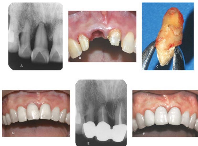
Figure 3. (A) Periapical radiograph illustrated a severe angular bony defect around tooth #11 (92% periodontal bone loss). (B) Tooth #11 was extracted atraumatically. (C) Clean preparation of root surface on tooth #11 before its replantation into extracted socket. (D) Splinting therapeutic provisional prosthesis of teeth #12, #11, and #21 to cement the tooth back to its original sites. (E) Radiograph indicating the reappearance of the lamina dura, good bone fill, and periodontal healing in 2014. (F) Clinical picture in 2014 revealed healthy periodontal tissue at replanted tooth #11 and neighbor fixed prosthesis after functioning properly for 7 years and 9 months.

A conservative treatment plan of TPPs, IR, and permanent FP was prescribed and explained in detail to the patient. Periodontal parameters GI, PII, CALs, and PPDs were measured (data not shown), a mobility test was recorded at baseline and every 6 months, and the ABL score was determined radiographically every 1–2 years, until the end of the study.