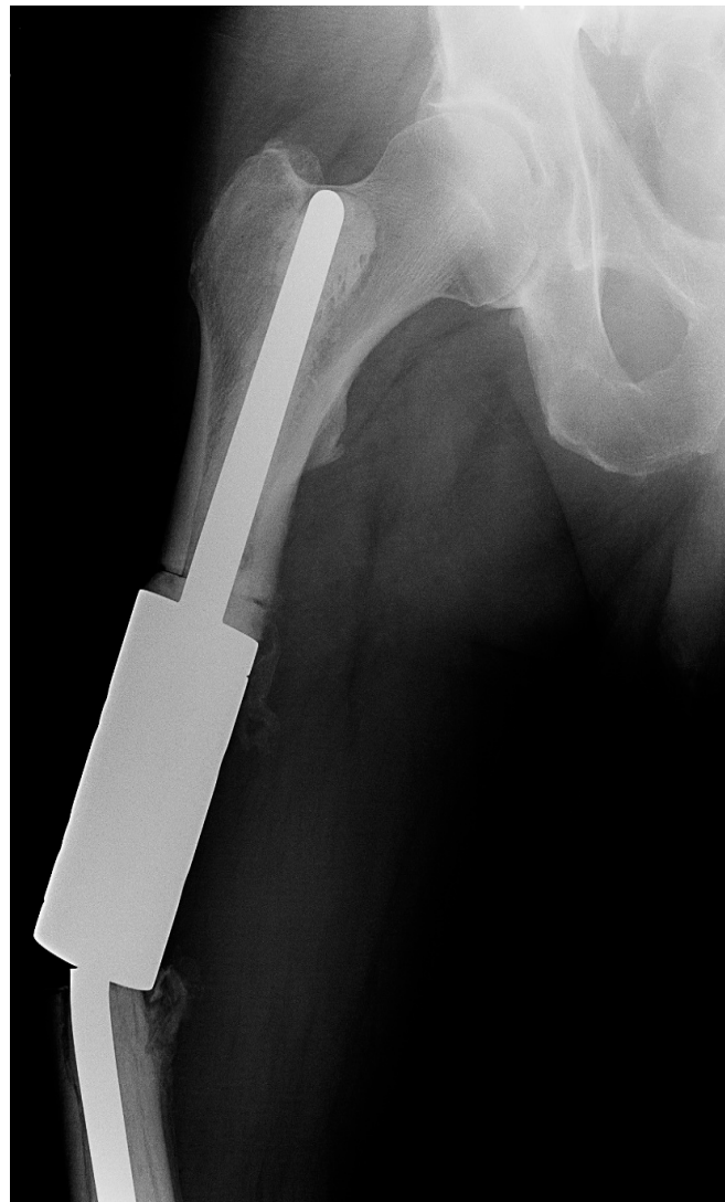
Figure 4. X-ray image of a fracture at the clamp-rod interface (type III failure) of an individual femoral diaphyseal implant for renal cell carcinoma oligometastatic disease. Revision intercalary endoprosthesis was performed. This image is from patient 8 in Table 1.