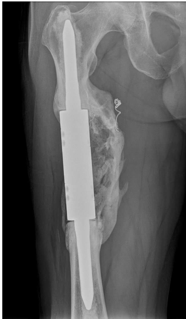
Figure 6. X-ray image of an intercalary endoprosthesis with the formation of heterotopic ossification around the implant after the resection of a renal cell carcinoma metastasis, with a bone bridge connecting the proximal and distal bone fragments. This image is from patient 1 in Table 1.

factor for failure. In our cohort of patients, there was not a significant relationship between the risk of failure and the resection length (the average resection length was 11.3 cm (range 8–16 cm)). According to Fuchs et al. [29], there is a contraindication to use intercalary spacers with standard stems to anchor lengths < 5 cm. According to Streitbürger et al. [21], the riskiest shaft anchorage is in the metaphyseal and metadiaphyseal locations. Only cemented stems were used in our group of patients. Cemented fixation is associated with increased postoperative function (MSTS score) and fewer complications [20]. An interesting factor that could minimise the risk of aseptic loosening and thus positively affect implant survival is the formation of heterotopic ossification around the implant, which often forms a bone bridge connecting the proximal and distal bone fragments [14,27,30,31]. We have repeatedly observed this condition forming around the reconstructions after resections of kidney cancer metastases (Figure 6).