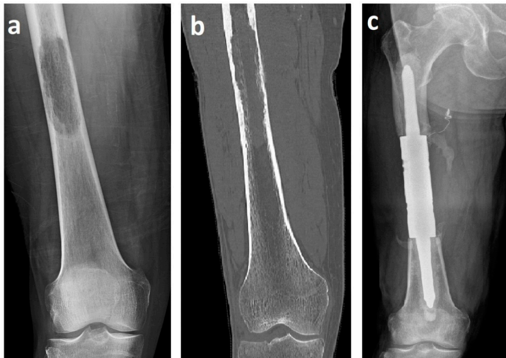
Figure 1. X-ray (a) and computed tomography (b) images of renal cell carcinoma solitary metastasis to the femoral diaphysis. X-ray image (c) after resection with a cemented intercalary endoprosthesis. These images are from patient 2 in Table 1.

dexterity and lifting ability. The score obtained at the last patient check-up was used for evaluation. The values were added, and the functional score is presented as a percentage of the maximum score possible.