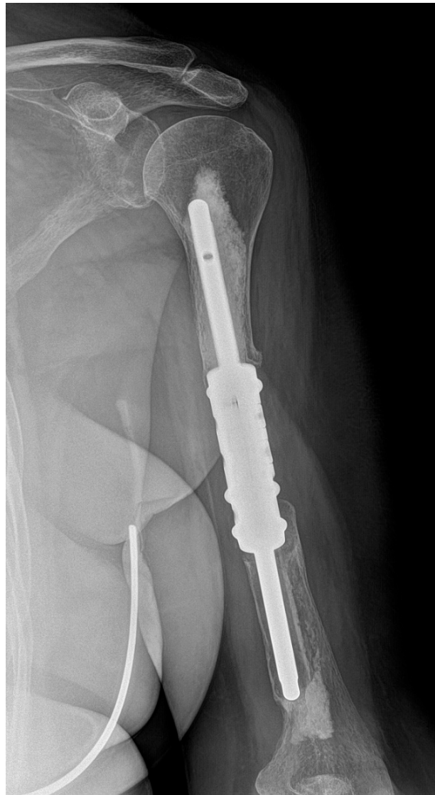
Figure 3. X-ray image of aseptic loosening of the distal stem of the humeral intercalary endoprosthesis. Resection of the metastasis revealed it was a uterine sarcoma solitary metastatic lesion of the left humerus. After 23 months, there was aseptic loosening. Due to the patient's poor general condition (pulmonary and multiple skeletal metastases) and acceptable functional result (a Musculoskeletal Tumor Society score of 21), revision was not indicated. This image is from patient 7 in Table 1.

Both cases of type III failure occurred on the femur (patients 8a and 13a). Both had a fracture of the individual implant (IIIa) that occurred at the clamp-rod interface (overall, 7.4% and 11.1% of femoral reconstructions) (Figure 4). The time to failure was 4 and 8 months from the surgery and required revision with a new spacer clamp.