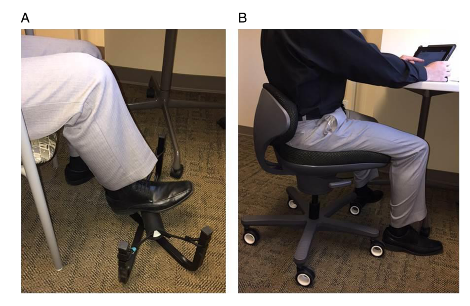
Figure 1 (A) FootFidget, http:// footfidget.com, and (B) CoreChair, https://www.corechair. com.