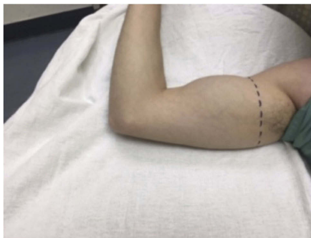
Figure 1 Approximate site of injection for local block and treatment line for cryoablation of intercostobrachial nerve (dotted line).

Informed procedural consent was obtained from the patient. In the supine position, the patient's arm was abducted and externally rotated. The area was prepped with a chlorhexidine solution and a 25-gauge needle was used to deposit local anesthetic solution just distal to the axillary fossa, from the deltoid muscle toward the triceps muscle along the anatomic localization of the ICBN (Figure 1). Ten milliliters of a solution containing 5 ml 0.25% bupivacaine, 4 ml of 1% lidocaine and 10 mg of triamcinolone was injected. After adequate anesthesia was obtained, cryoneurolysis was performed using a