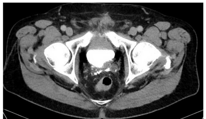
Fig. 1. A 3.1 × 2.0 cm left pelvic mass concerning for malignancy is seen compressing the bladder and displacing the left distal ureter anteriorly.

He was followed up 3 months later at which time he was reimaged with a pelvic ultrasound. This showed the mass along the left posterior aspect of the urinary bladder and contiguous with bladder wall now measuring 1.8 × 1.9 cm. This was thought to be very similar in size when accounting for differences in imaging techniques. He is now without any urinary complaints after removal of his bladder stone. He specifically denies dysuria,