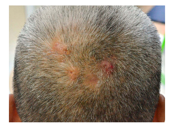
Figure 2 Pseudocyst of the scalp/alopecic and aseptic nodules of the scalp: soft and dome-shaped alopecic nodules, slightly erythematous and pustules on surface, surrounded by an area of normal skin.

The etiology remains questionable. Some authors assumed that it was a spectrum of follicular occlusions that cause deep folliculitis, leading to non-scarring alopecia and eventually a pseudocyst formation. Some believed that the follicular occlusion was only a predisposing factor as it was not observed in every case. In our opinion, the PCS/AASN