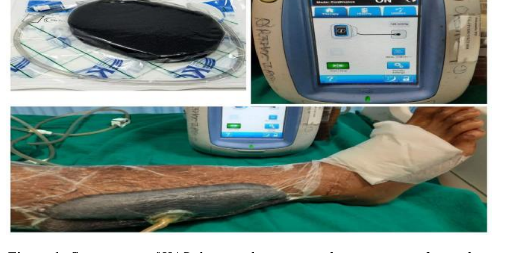
Figure 1 : Components of VAC showing the sponge to be approximated over the wound, adhesive sealant, connecting tube and VAC machine along with its attachment in the patient.

Patients with age between 16 to 50 years, wound size equal or more than 16 cm<sup>2</sup> (measured by maximum length multiplied by maximum width) and present below the knee joint which presented within seven days of occurrence were included in the study. Patients having any comorbidity, addiction, circumferential wound over the leg, associated vascular injury, preexisting venous ulcer disease and wound size less than 16 \text{ cm}^2 were excluded from study. Sixty consecutive patients who met the inclusion and exclusion criteria were divided into VAC and TOT group alternatively. After informed and written consent was obtained, wound was assessed and graded under Bates-Jensen wound assessment tool (BWAT) at 8 days interval and final score obtained when the wound bed was ready for secondary surgical procedure (6). The secondary surgical procedure planned was split thickness skin grafting. Healing rates were assessed by BWAT (Table 1). Percent area reduction was noted at final follow up which was calculated by the area of the wound at final follow up over the original area of the wound.