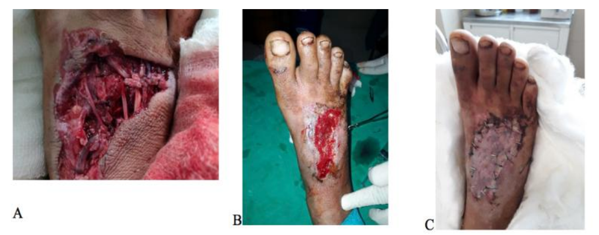
Figure 4 : Depiction of a case under TOT with the A) initial injury, B) before secondary surgery and C) after final skin grafting.

Descriptive analysis of the data was done in terms of mean and standard deviation. Wilcoxon test was used for non-parametric data analysis. The analysis of difference in significance was done by Friedman Q test. ANOVA test was used for comparison between time duration and percent area reduction in individual cycles. Post hoc Bonferroni correction was applied for the multiple