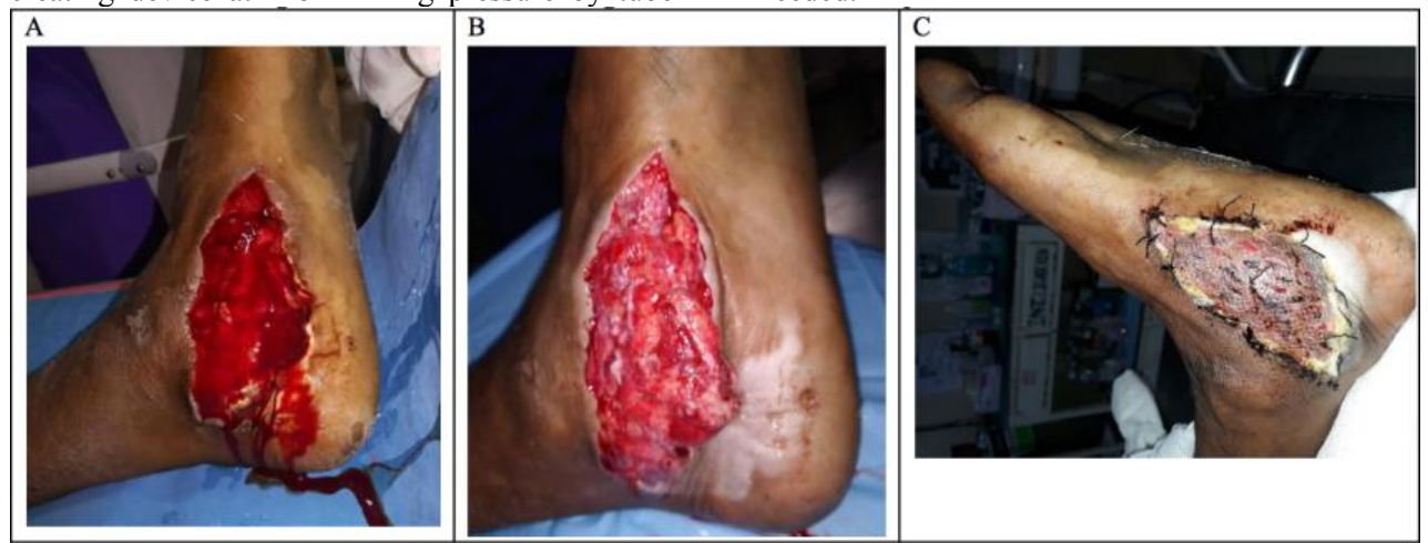
Figure 2 : Depiction of a case under VAC with the A) initial injury, B) before secondary surgery and C) after final skin grafting.

(Figure 1). Discharge was collected in the transparent canister attached with VAC machine. This was kept applied continuously for a period of 5 days followed by a 3-day break. The cycle was discontinued when the wound was healthy and ready for secondary coverage (Figure 2). Repeat debridement was done in between the cycles, if needed.