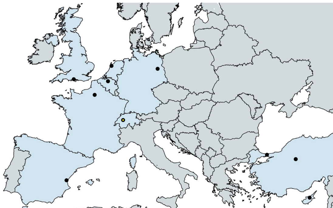
Figure 1 Centres currently participating to the EPIC-PCD cohort study. The EPIC-PCD clinics are marked with a black dot and the EPIC-PCD data centre with a yellow dot. EPIC-PCD, ear–nose–throat prospective international cohort of patients with primary ciliary dyskinesia.

be small variations in recruitment and data collection between participating centres to allow the study to be embedded in the regular clinical routine.