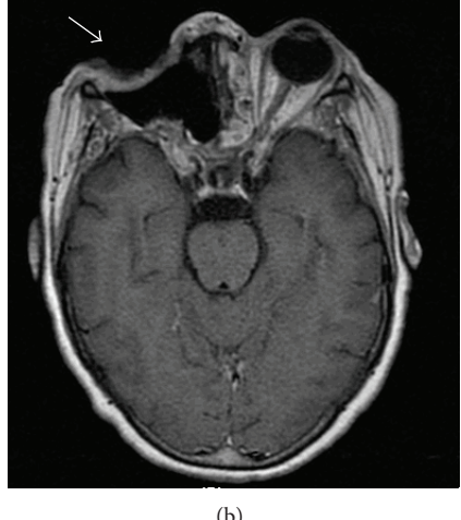
FIGURE 1: (a) An example of a computed tomography showing sinusitis (black arrows). Biopsies were positive for mucormycosis in this patient. (b) Postsurgical magnetic resonance image (T1 weighted) in a patient with ocular involvement. The patient recovered well.