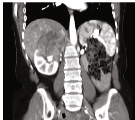
FIGURE 2: Coronal CT view of the lesion, showing the involvement of the right kidney and IVC.

and advanced disease, as it induces preoperative infarction and facilitates surgical intervention [11], this was not possible in our patient, as radiological evaluation did not certainly confirm renal versus hepatic origin of the tumor, and there was no single certain feeding vessel.