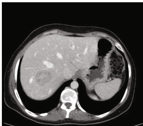
FIGURE 3: Axial CT view of the lesion, showing the lesion invading the liver parenchyma.