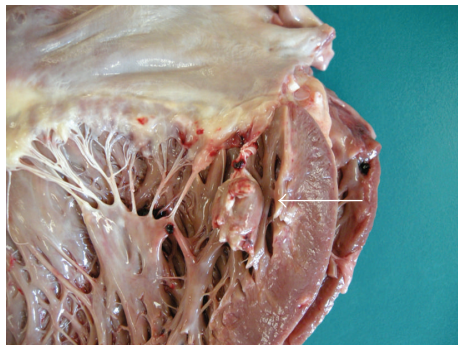
FIGURE 2: Autopsy image of the mitral valve showing the upper portion of the ruptured papillary muscle (arrow).

the importance that patients with antiphospholipid antibodies should be closely monitored when they undergo surgical intervention.