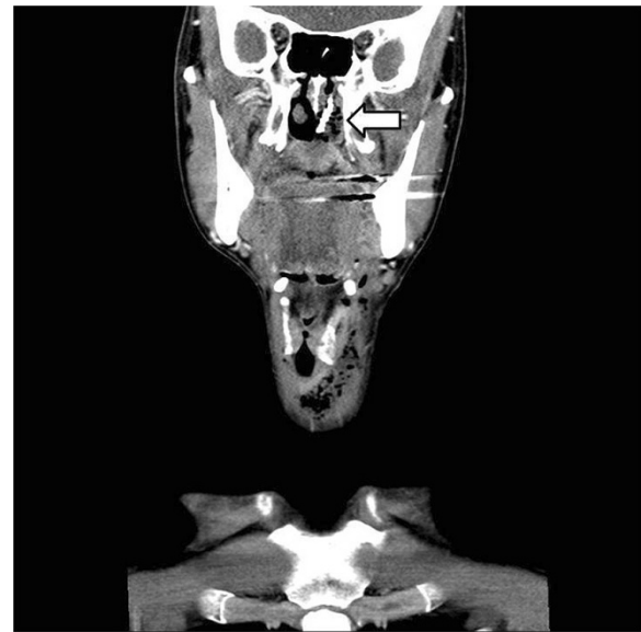
Figure 3 Coronal view of same CT. (Arrow) A neck CT shows the toothbrush spanning the nasopharynx and oropharynx, as well as subcutaneous emphysema in the anterior and lateral cervical regions.

To evaluate hypopharyngeal and esophageal damage, an esophagogram was obtained using a water-soluble contrast dye on the first postoperative day, and a small perforation in the hypopharyngeal region was identified. Accordingly, the patient received conservative therapy, including intravenous broad-range antibiotic administration and was placed on oral dietary restrictions. No specific findings or complications were detected via the esophagogram on the 10 th postoperative day, and the patient was subsequently discharged and is currently being followed up (Figures 6 and 7).