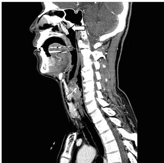
Figure 2 Sagittal view of neck CT scan. (Arrow) A neck CT shows the toothbrush spanning the nasopharynx and oropharynx, as well as subcutaneous emphysema in the anterior and lateral cervical regions.

An intraoral approach employing nasotracheal tube insertion under general anesthesia was used. The exposed part of the toothbrush was cut with an electric surgical saw. Following the removal of the two separate parts, the uvular laceration was sutured and the surgery was completed (Figures 4 and 5).