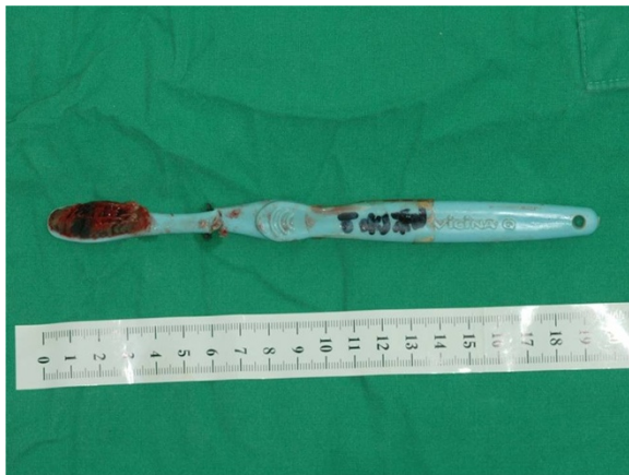
Figure 5 The removed toothbrush after the surgery. Total length is approximately 20 cm.