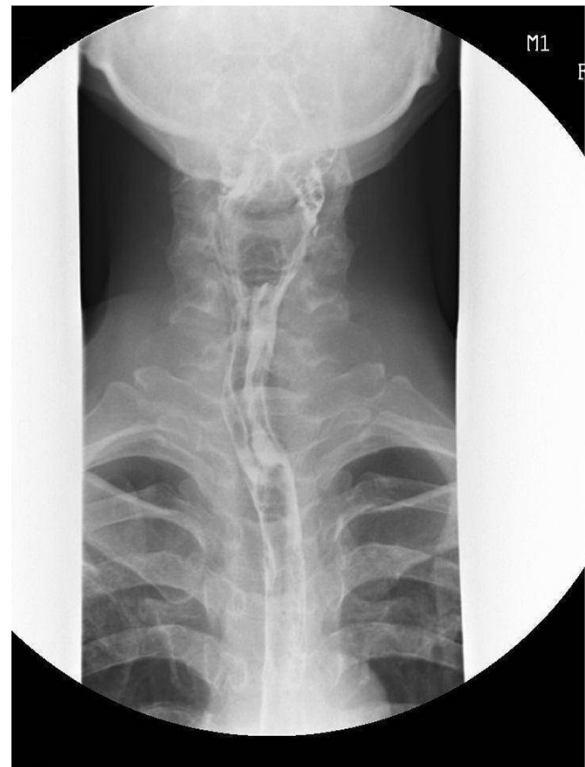
Figure 7 Normal findings were observed on an esophagogram performed on the 10 th postoperative day.

A toothbrush is a commonly used object in one's daily life, but visiting the emergency room because of swallowing a toothbrush is rare; such a case may rarely occur in patients with mental retardation or a history of psychological disorders. Unlike a typical small foreign body, a toothbrush rarely passes through the gastrointestinal