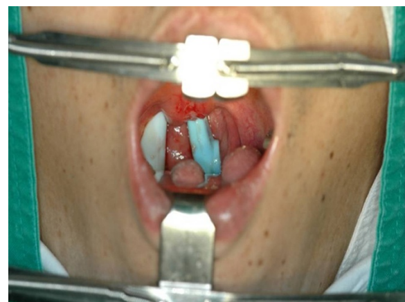
Figure 4 At the oropharynx, part of the toothbrush handle is observed.

To evaluate hypopharyngeal and esophageal damage, an esophagogram was obtained using a water-soluble contrast dye on the first postoperative day, and a small perforation in the hypopharyngeal region was identified. Accordingly, the patient received conservative therapy, including intravenous broad-range antibiotic administration and was placed on oral dietary restrictions. No specific findings or complications were detected via the esophagogram on the 10 th postoperative day, and the patient was subsequently discharged and is currently being followed up (Figures 6 and 7).