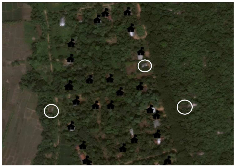
Figure 2 Screenshot of identification of missing households. The figure illustrates how by using Google Earth (Earth data: Google, DigitalGlobe) and the GPS data, the progress of data collection can be monitored. The locations of completed household surveys are marked using house icons. The households circled in white are households which were missed. The supervisors were able to direct data collectors by using these maps, to ensure that all households were approached. Source : "Missed households." 8°08′28.27" N and 80°19′35.42" E. Google Earth. April 4, 2011. May 15, 2013.

coverage was not possible the following day, especially if the backup battery store was also affected.