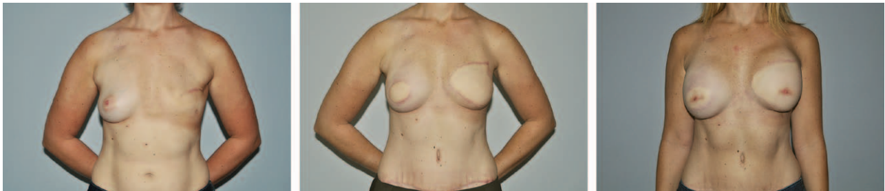
Fig. 3. A 37-year-old woman with history of bilateral mastectomies (A) and delayed DIEP flap breast reconstruction (B). C, Postoperative results with a left-sided, 265-cm 3 and right-sided, 210-cm 3 silicone gel implants, with additional nipple reconstructions.

breast, giving an aesthetically pleasing shape to the reconstruction, whereas the secondary placement of a silicone gel implant provides the desired volume. As opposed to other tissue-based reconstruction techniques like the latissimus dorsi flap, where a larger implant is required due to the reduced volume provided by the flap, smaller implants can achieve a fuller look when combined with the DIEP flap (average size in our cases was 229mL), thus possibly decreasing the rate of complications that may arise from mechanical pressure from the underlying implant.