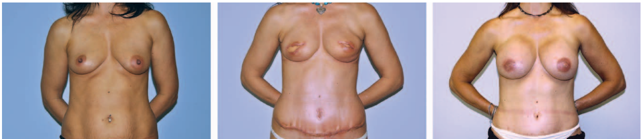
Fig. 2. A, A 46-year-old woman with multifocal ductal cancer. B, Underwent bilateral DIEP flap breast reconstruction following skin-sparing mastectomies. C, Postoperative results with 340-cm 3 silicone gel implants and additional nipple reconstructions.