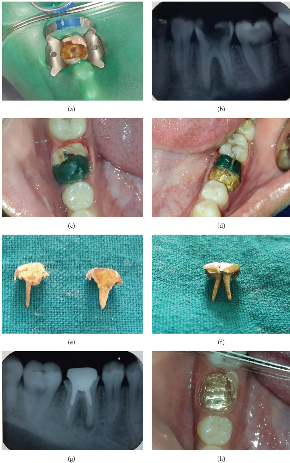
FIGURE 1: (a) Preoperative intraoral photograph showing grossly carious tooth. (b) Preoperative IOPAR showing grossly decayed molar with roots showing parallel configuration. (c) Fabrication of wax pattern in mesiolingual canal involving mesial half of the tooth. (d) Wax pattern fabrication of the distal half with mesial post and core in place. (e) Mesial and distal sections of split cast post and core. (f) Assembly of mesial and distal sections of split cast post and core. (g) IOPAR of luted and finished split cast post and core. (h) Luted and finished split cast post and core.