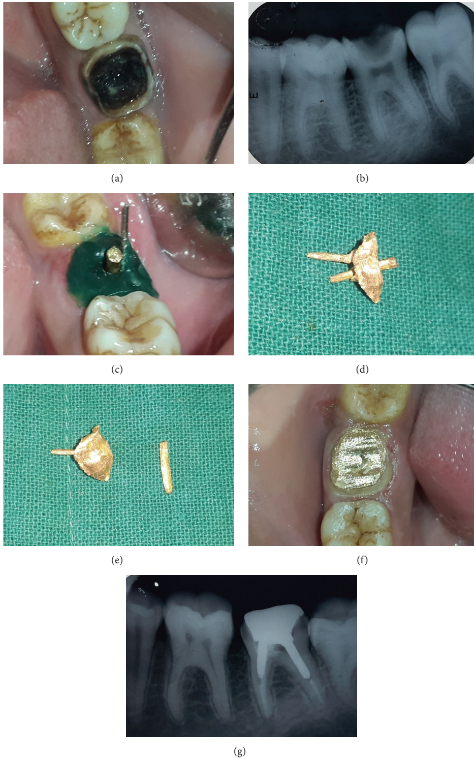
FIGURE 2: (a) Preoperative intraoral photograph showing grossly decayed molar. (b) Preoperative IOPAR showing grossly decayed molar with divergent root configuration. (c) Wax pattern fabrication of mesiolingual canal and core with distal casting in place. (d) Assembly of mesial and distal sections of split cast post and core. (e) Mesial and distal sections of split post and core. (f) Luted and finished split cast post and core. (g) IOPAR of luted and finished split cast post and core.