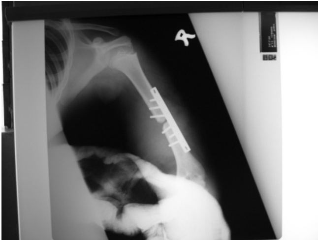
Figure 1 Day two postoperative X-rays of the right arm.

Amputations may be classified by the site of injury, type of injury (crush, sharp or avulsion) and degree of contamination and associated local injuries. 2 Amputations of the upper limb may be divided into major and minor depending on whether the amputated part has significant muscle bulk. 6 Major amputations are those at the level of the wrist or proximal, such as the index case. 6 The more proximal the amputation, the greater the muscle load 5,6 and muscle does not tolerate ischemia well. 5,6 Proximal amputations have poorer prognosis. 2,6,7 The major reason for poor outcomes of high-level reimplantation is difficulty in restoring nerve function. This may result in joint stiffness, joint instability, infection, skin and muscle necrosis. 7-9