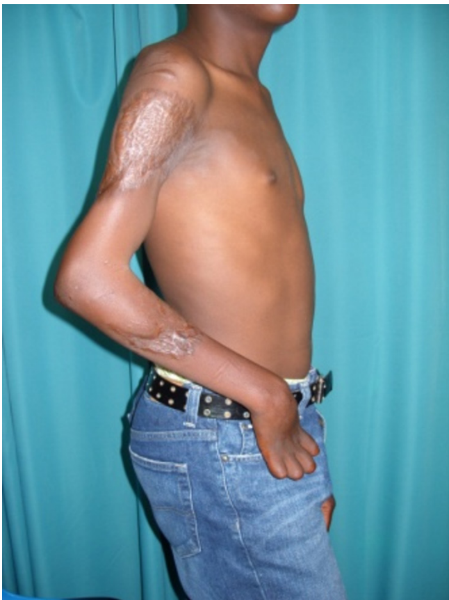
Figure 2 Lateral view of the patient 4 years postinjury.

Amputations may be classified by the site of injury, type of injury (crush, sharp or avulsion) and degree of contamination and associated local injuries. 2 Amputations of the upper limb may be divided into major and minor depending on whether the amputated part has significant muscle bulk. 6 Major amputations are those at the level of the wrist or proximal, such as the index case. 6 The more proximal the amputation, the greater the muscle load 5,6 and muscle does not tolerate ischemia well. 5,6 Proximal amputations have poorer prognosis. 2,6,7 The major reason for poor outcomes of high-level reimplantation is difficulty in restoring nerve function. This may result in joint stiffness, joint instability, infection, skin and muscle necrosis. 7-9