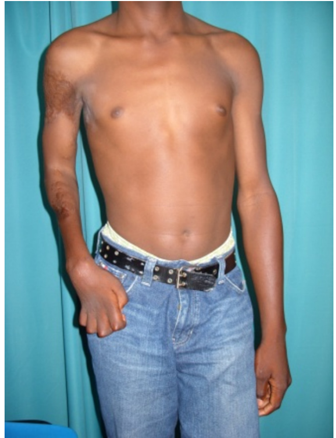
Figure 3 Anteroposterior view of the client 4 years postinjury.

Proximal amputations are also associated with an increase in the number of required secondary procedures. 6 The greater the time required for severed nerves to regenerate to the end plates, the worse the chances of recovery. 10 This factor also applies to children. 11 Saies et al 11 found that age did not affect functional outcome; however, children less than 9 years of age had a significantly higher rate of limb survival. 11