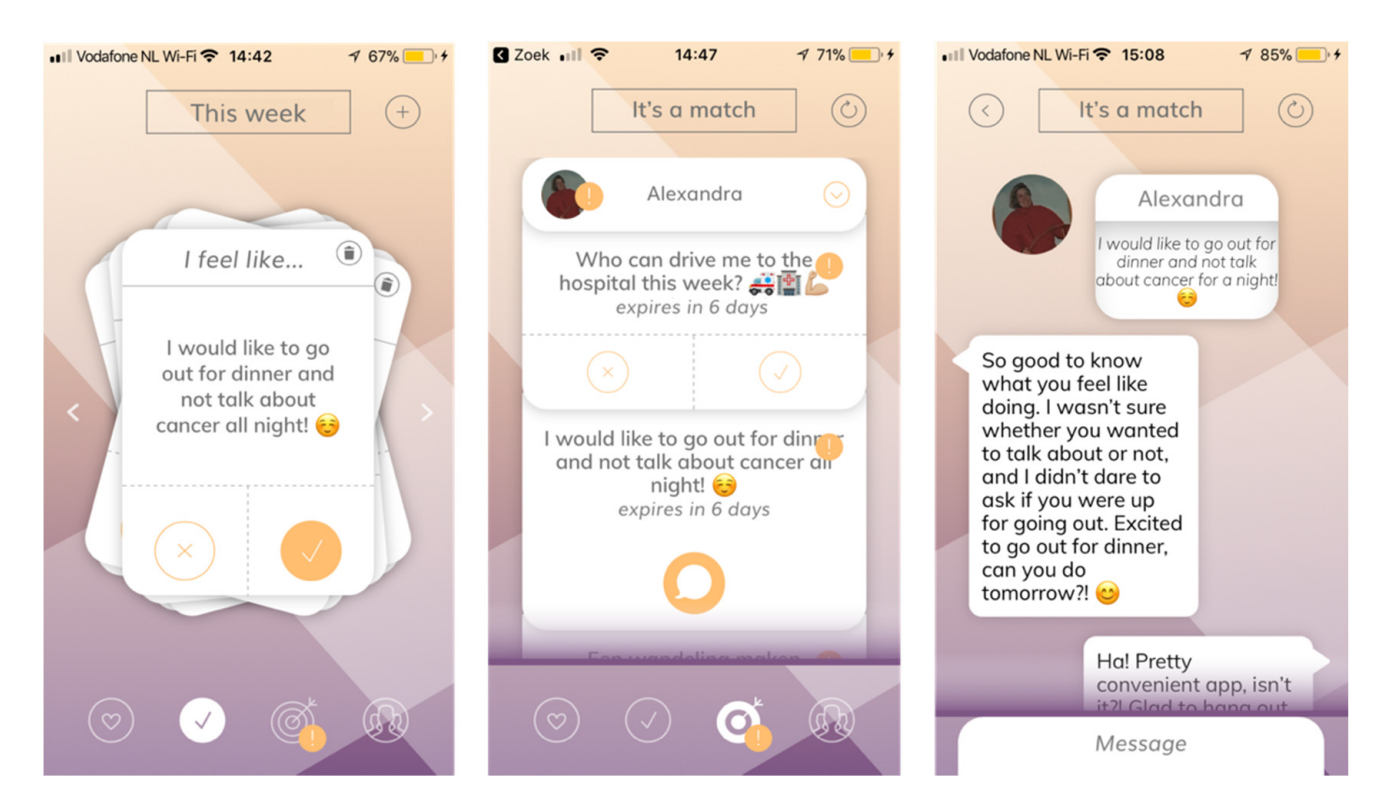
Figure 4. Different screens of the final product: AYA Match. More is available in this demo video in the Supplementary Materials (Video S1).

The final phase was kicked off with the official launch of the application, which enabled anyone interested to download and start using AYA Match. The application ended up with two main features, as described in Section 3.1.2 and shown in Figure 4.