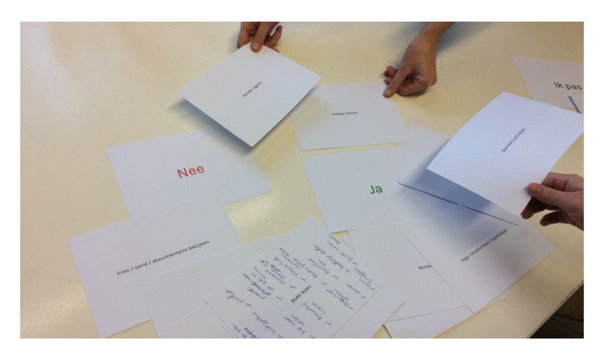
Figure 2. During the paper prototype session AYA cancer patients and their loved ones were invited to interactively try out the concept.

For the paper prototype session seven AYA cancer patients and their loved ones were invited to interactively try out the concept during a face-to-face focus group meeting, using printed cards containing the different screens of the potential application (Figure 2). By actually trying out the concept instead of just presenting it, honest and specific feedback was elicited. During this session oral feedback was obtained on the first nondigital version of the prototype.