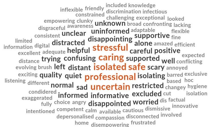
Fig 5. Word cloud, partner's experiences of receiving maternity care in Australia during the COVID-19 pandemic.

The findings of this research offers important insight as it reveals a divergence between consumers' and providers' experiences of, and satisfaction with, the way maternity health service redesign occurred during the pandemic. Whilst health professionals and midwifery students were also concerned about the changes to maternity care, it was not to the same extent