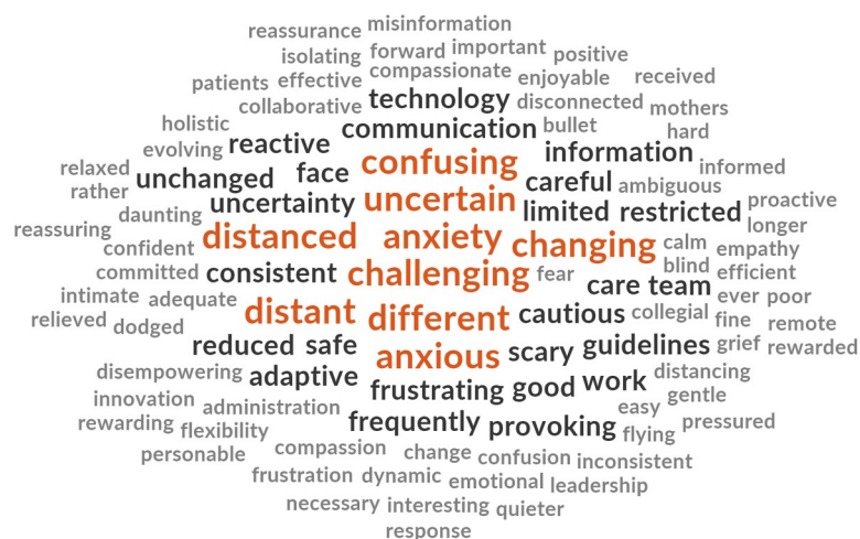
Fig 7. Word cloud, doctors' experiences of providing maternity care in Australia during the COVID-19 pandemic.

indicated by women. This difference may be for a number of reasons such as health professionals' understanding of the need to minimise risk, or due to an awareness of government regulations, and constant updates which families would not have access to. Another contributing factor may be the personal and professional divide in the nature of each cohorts' responses. Women and their partners or support people are likely to have a deep and personal investment in their experience, and frequent changes in health care provision could understandably influence their satisfaction during periods of vulnerability. For practitioners, professional standards require flexibility and adaptability to change in the clinical environment, which may have impacted responses. The management of infection prevention and control implies minimisation of contact between individuals to reduce transmission of the virus. In the context of maternity care, prioritising protection for health care providers presents unique challenges given the preference for relational models of care that focus on connection between the consumer and provider of care. This conflict may explain some of the differences in the experiences of those who received, versus those who provided care during the pandemic. Further research using in depth approaches is needed to explore the phenomenon of consumer and