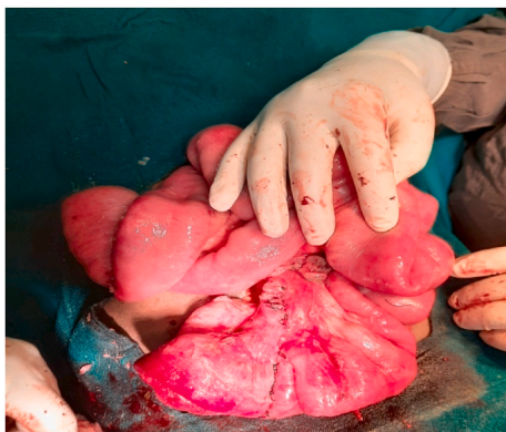
Fig. 3. End-to-end ileoileal anastomosis.

was herniating into closed space while proximal bowel loops were dilated with normal color. The diverticular band was divided and detorsion of Meckel's diverticulum was done. Herniating segments of ileum were reduced. Resection of gangrenous Meckel's diverticulum and