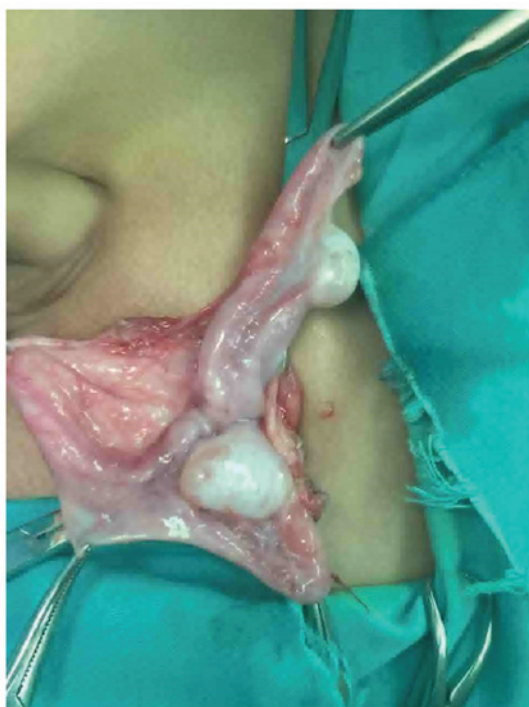
Figure 3. Uterine remnant. During surgery there was a similar kind of uterine like tissue found between the two testes.

AST, aspartate transaminase; ALT, alanine transaminase; ACTH, adrenocorticotrophic hormone; LH, luteinizing hormone; FSH, follicle stimulating hormone; T, testosterone; E2, estradiol; PRL, prolactin; PGN, progesterone; hCG, human chorionic gonadotropin; AMH, anti-Müllerian hormone, INH-B, inhibin B.