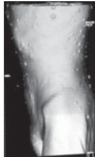
Figure 1: Surface-rendered CT image showing multiple cutaneous neurofibromas

Contrast-enhanced CT revealed a large, sessile, polypoidal, soft tissue mass with mild to moderate postcontrast enhancement along the greater curvature of the stomach.