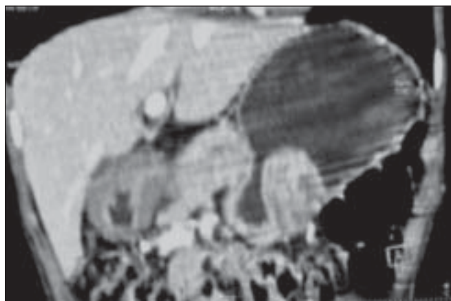
Figure 3: Oblique coronal CT MPR image showing polypoidal neurofibroma along the greater curvature of the stomach along with diffuse thickening of the wall of the pyloric antrum

The patient underwent surgery for the relief of the gastric outlet obstruction. Histological results of the polypoidal mass were consistent with those for neurofibroma, and the mural thickening in the pyloric antrum was found to be due to submucosal neurofibromatosis.