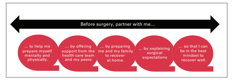
Fig. 3. A patient-oriented preoperative program has the potential to ameliorate deterioration during the waiting period for surgery and promote a mindset to recover well. It is essential to recognize that preoperative preparation should occur on a continuum that meets patients where they are at and in a partnership that respects patients' expertise and desired level of engagement.

care professionals during this time. Many also perceived deterioration of their mental (e.g., anxiety) and physical (e.g., weight loss) states, and the longer they waited for surgery, the greater the deterioration.