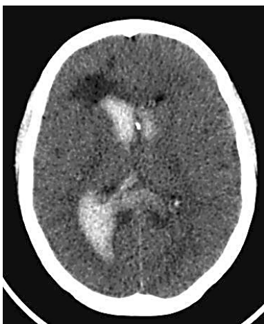
Fig. 1. Brain CT scan on day 8 showing bilateral (right > left) intraventricular hemorrhage.

In conclusion, intraventricular hemorrhage following moyamoya disease is a rare entity during pregnancy, particularly in Caucasian women. As some patients may have experienced a previous pregnancy without complication, it remains difficult to establish the risk factor directly related to pregnancy. The prognosis, usually poor, could be influenced by surgical removal of the clot, in case of refractory high ICP, and by the adequate management of hemodynamic and respiratory parameters, particularly in the type with both hemorrhagic and ischemic complications. Vasospasm is a possible complication that can not be easily demonstrated in this particular setting. The question if a revascularization procedure is effective to prevent rebleeding is not yet fully answered [15].