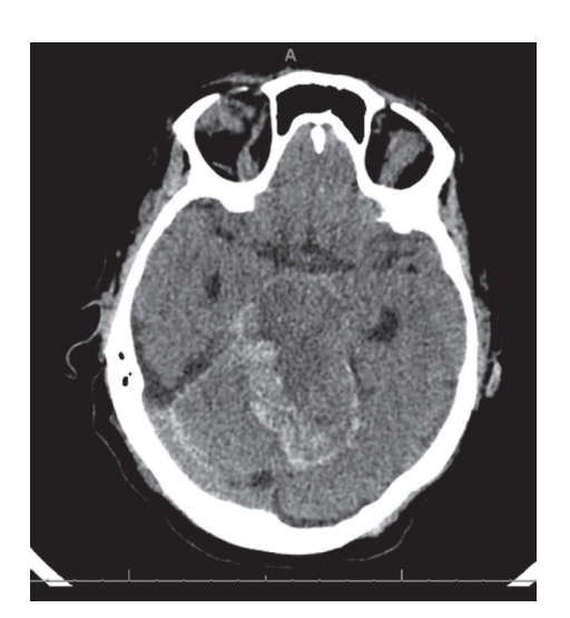
FIGURE 2: Marked areas of hemorrhage and upward herniation of cerebellum.