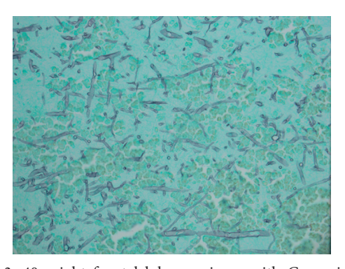
FIGURE 3: 40x right frontal lobe specimen with Gomori methenamine-silver (GMS) staining showing large, nonseptate hyphae with 90 degree angle branching and nonparallel walls consistent with mucormycosis.