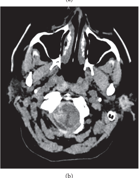
FIGURE 1: Peripheral hemorrhage in the cerebellar folia with associated areas of hypodensity (a), along with hypodensity and hemorrhage within the brainstem (b), both consistent with ischemia.

literature, only case reports exist of mucormycosis leading to intracerebral or intracerebellar hemorrhage. Takahashi et al. [10] report a case of subcortical hemorrhage while Malik et al. [11] report a case confined to the basal ganglia, whereas Munoz et al. [12] report a lobar hemorrhage case. We could not find any case which describes tonsillar herniation resulting from fungal-related intracerebral swelling. This sequence of events highlights the significant amount of edema invasive mucormycosis can cause, and how quickly it can lead to death. Because lung specimens, both microbiologically and histologically, were positive for Mucor spp., this was the likely reservoir for disease dissemination.