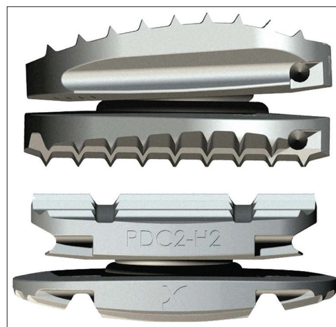
Figure 4: Side view (top image) and front view (bottom image) of the Discocerv implant showing that the superior plane is convex and lordotic, mimicking the normal anatomy