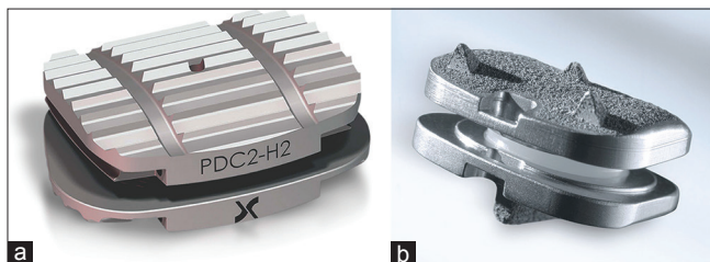
Figure 1: (a) Anterior oblique view of Discocerv. The end-plates are designed with an anatomical profile characterized by convexity in the sagittal plane for the upper plate and convexity in the frontal plane for the lower plate. (b) Anterior oblique view of Activ-C implant. It consists of a superior prosthesis plate with spikes for anchoring in the vertebral body, and an inferior prosthesis plate with integrated polyethylene inlay and central anchoring fin for fixation in the vertebral body

We hypothesized that due to the reduced time in end-plate preparation, the newer generation of implants can be