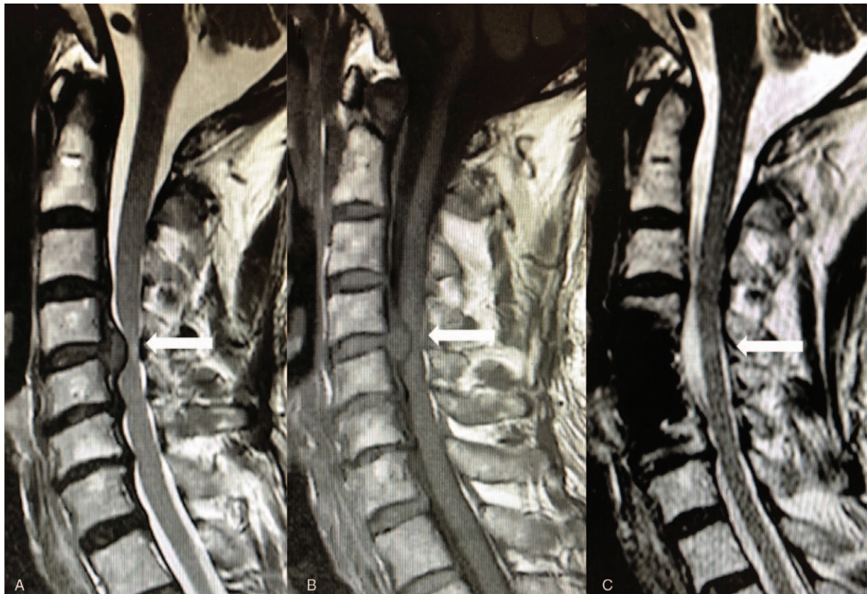
Figure 1. A 53-year-old male CSM patient with anterior compression at C4/5 and C5/6 (A). Duration of symptoms was 14 months at the initial visit. ISI was observed at C4/5 level on T2W MR images (a, white arrow). No sign of decreased signal intensity was found on T1W MR images (B). At the final follow-up (25-month post operation), remaining ISI was noticed on T2W MR images (c, white arrow). CSM = cervical spondylotic myelopathy, ISI = increased signal intensity.