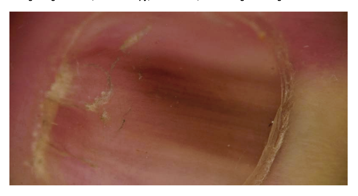
Fig.2. Left hand fifth finger, dermatoscopy, Molemax HD, 30X: light brown to brown non-homogeneous band formed by longitudinal, irrgular, interrupted stripes