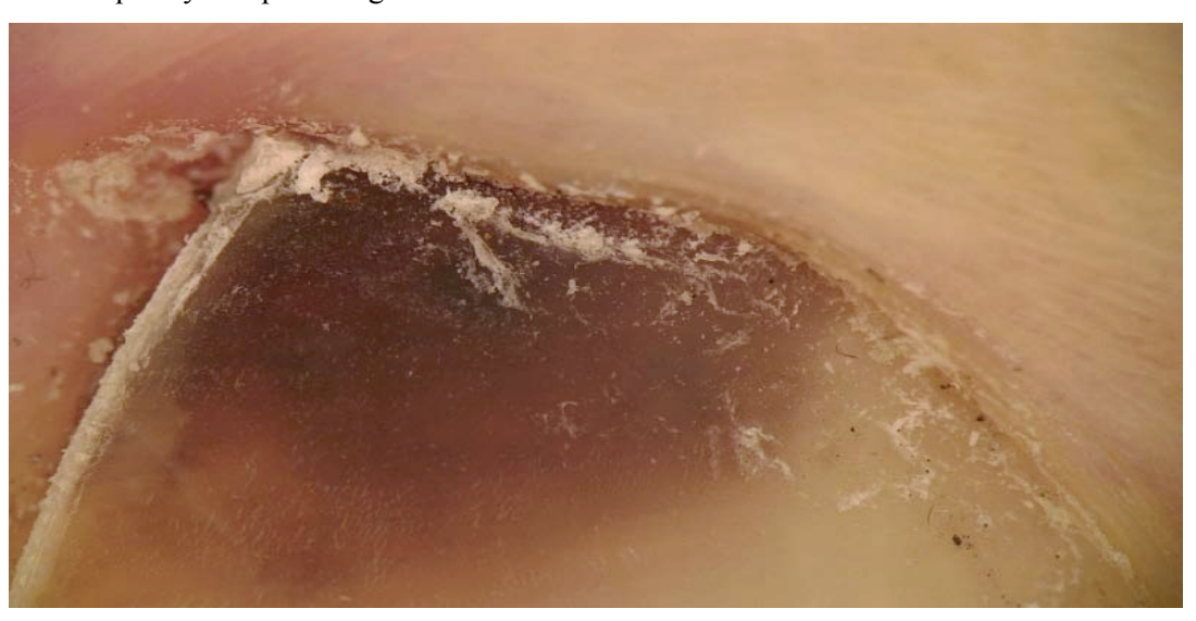
Fig.1. Right first toe, dermatoscopy, Molemax HD, 30X: homogeneous light brown stain

Malignant melanoma was diagnosed in 1 patient (3.03%) (Fig.2).