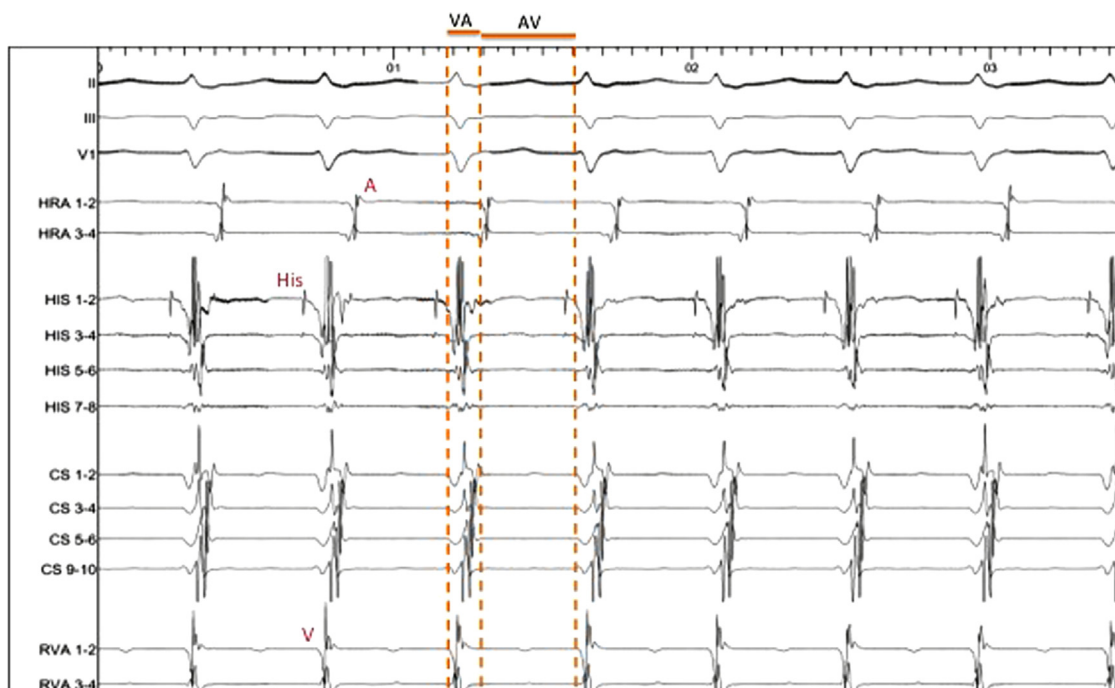
Figure 2 Intracardiac electrogram showing the patient’s clinical tachycardia as a typical slow–fast atrioventricular nodal reentrant tachycardia (133 beats/min, cycle length 450 ms). A = atrial signal; H = signal of the His bundle; V = ventricular signal.

recurrence rates). 1 Overall, the use of cryoenergy instead of RFC in patients with DBS represents a safe and reasonable alternative. In the future, cryoenergy is not only a possibility to treat AV nodal–dependent tachyarrhythmias, but it could also be used to perform pulmonary vein isolation with the cryoballoon in DBS patients suffering from atrial fibrillation.