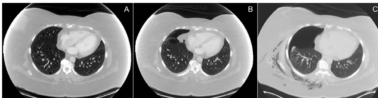
Figure 2 Serial computed tomography imaging of the thorax. A) Image at 1 month postlumpectomy shows seroma in the lumpectomy bed and several small lung cysts, without evidence of pneumothorax. B) Four months postradiation, there is spontaneous pneumothorax in the region of the tangent radiation, and persistent lung cysts can be observed bilaterally. C) Eight months postradiation, there is repeat pneumothorax, partially loculated and subcutaneous emphysema is noted as well. Lung cysts persist bilaterally.

After comprehensive radiation to the breast and nodes, the lumpectomy bed was treated with an additional 10 Gy boost. A lung dose-volume histogram for the composite plan was reviewed, with ipsilateral V20 of 35% and total lung V20 of 20%. Ipsilateral V5 was 62%, and ipsilateral V10 was 45%. The maximum lung dose was 51 Gy. These lung doses are within our institutional constraints and meet variation acceptable criteria of current national protocols on comprehensive radiation. 8,9 Priority was placed on adequate target coverage in the setting of aggressive disease and inability to undergo chemotherapy. The patient tolerated treatment well without unexpected acute toxicity.