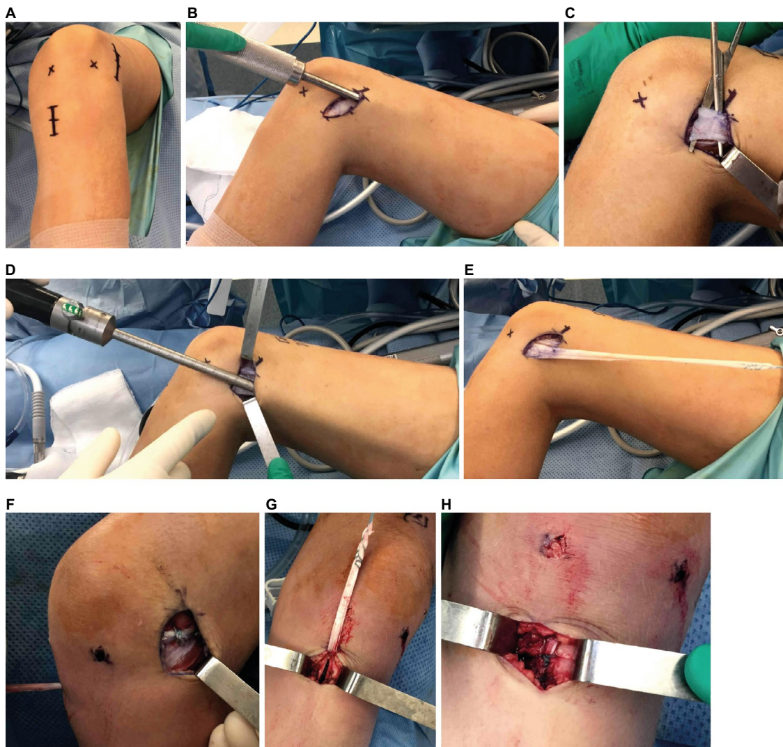
Figure 2 Physeal-sparing ACL reconstruction with iliotibial band autograft.

In physeal-respecting ACL reconstruction, soft tissue grafts are utilized. As shown in animal studies, premature closure of an injured area of the physis is less likely to occur if soft tissue is interposed at the site of injury. 60 Tibial and femoral tunnels can be drilled slightly more vertically to