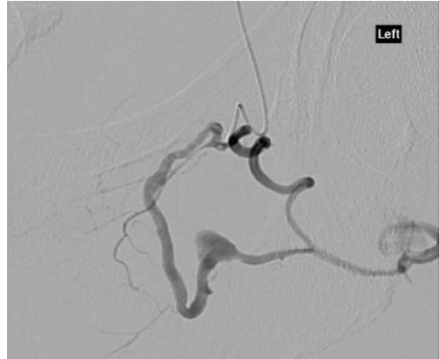
Figure 2: CT angiography with dye showing dilatation of collateral branch of left obturator artery.

No clear bleeding point could be identified, so decision was made to close the skin with a corrugated drain left in situ. Following closure, there was significant bleeding through the dressing and so the wound was re-explored with vascular surgical input.