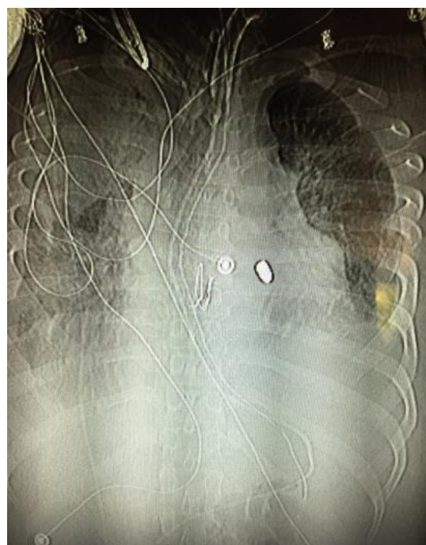
Figure 2. Anteroposterior chest x-ray demonstrating bullet fragment overlying the cardiac shadow.