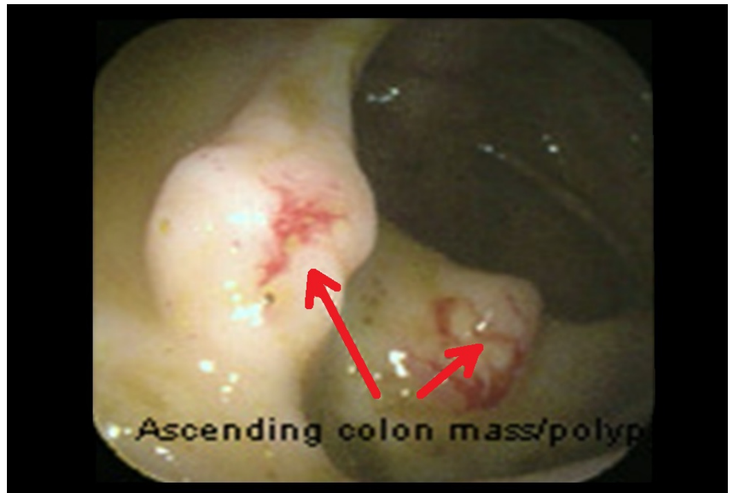
FIGURE 2: Colonoscopy

Colonoscopy showing ulcerated polypoid nodules (red arrows).