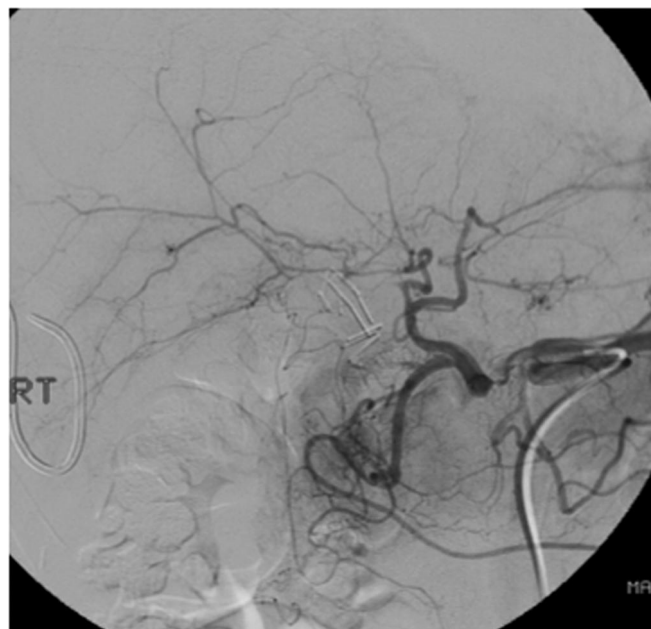
Figure 3. Angiogram showing right hepatic artery injury. Note the presence of a left hepatic artery that bifurcates into lateral and medial branches with the latter creating an anastomosis to supply the right lobe. Note the stump of the original right hepatic artery. Clips in the place corresponding to the take-off of the right hepatic artery.

on oral antibiotics with appropriate instructions about refeeding her bile.