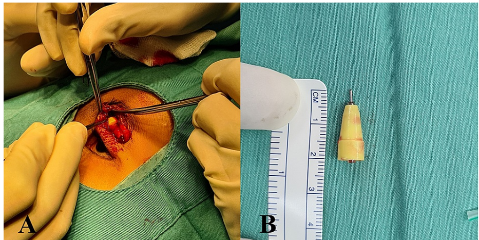
FIGURE 4: Surgical removal of the foreign body (A) and the foreign body, a pen tip, measuring 2.1 cm in length (B)

Surgical exploration under general anesthesia revealed a pen tip measuring 2.1 cm in length, which was situated between the preseptal fat and orbicularis muscle (Figure 4). The pen tip and the surrounding granuloma were removed. Histopathology examination of the granulomatous tissue showed chronic inflammation changes consistent with the foreign body reaction. Post-operatively, the child was given a one-week course of oral amoxicillin/clavulanic acid 280 mg twice daily and ointment chloramphenicol three times daily over the wound. After two weeks, the wound healed well, and the swelling was completely resolved (Figure 5). The child was seen again at three months and discharged from our clinic.