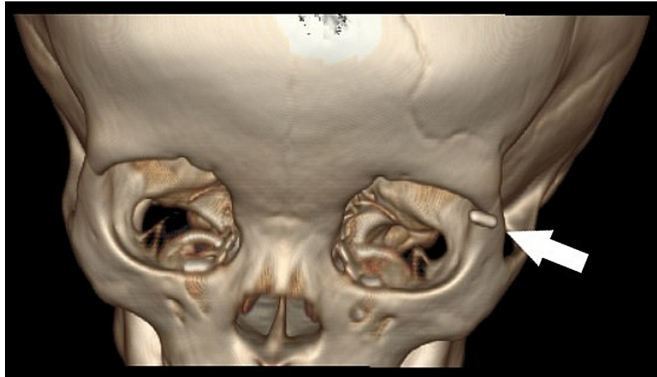
FIGURE 3: CT 3D reconstruction showing the exact location of the foreign body (white arrow)

Surgical exploration under general anesthesia revealed a pen tip measuring 2.1 cm in length, which was situated between the preseptal fat and orbicularis muscle (Figure 4). The pen tip and the surrounding granuloma were removed. Histopathology examination of the granulomatous tissue showed chronic inflammation changes consistent with the foreign body reaction. Post-operatively, the child was given a one-week course of oral amoxicillin/clavulanic acid 280 mg twice daily and ointment chloramphenicol three times daily over the wound. After two weeks, the wound healed well, and the swelling was completely resolved (Figure 5). The child was seen again at three months and discharged from our clinic.