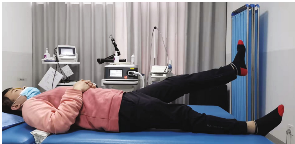
FIGURE 4: Straight leg elevation for quadriceps training after the operation.