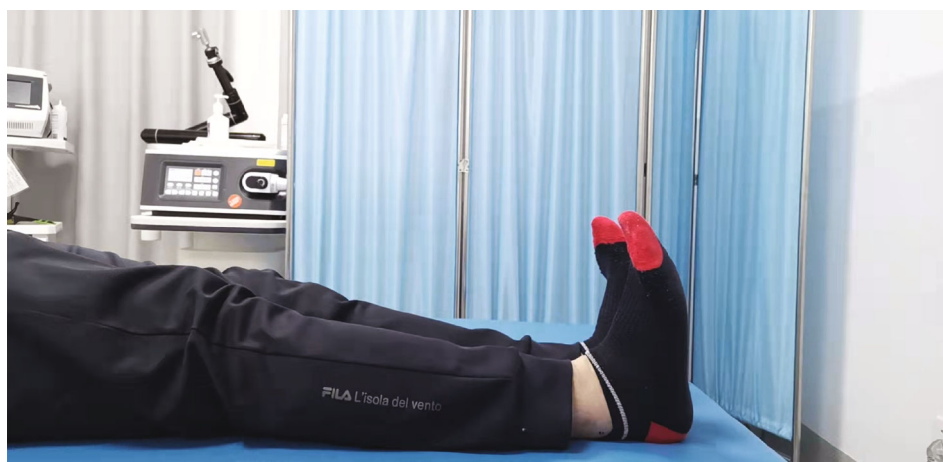
FIGURE 5: Ankle pump training after the operation.

operation, the patients began moderate physical activities of their own preference. Nine months after the operation, the patients began complete strenuous exercise (activity level, weight bearing, and brace use; see Table 3).