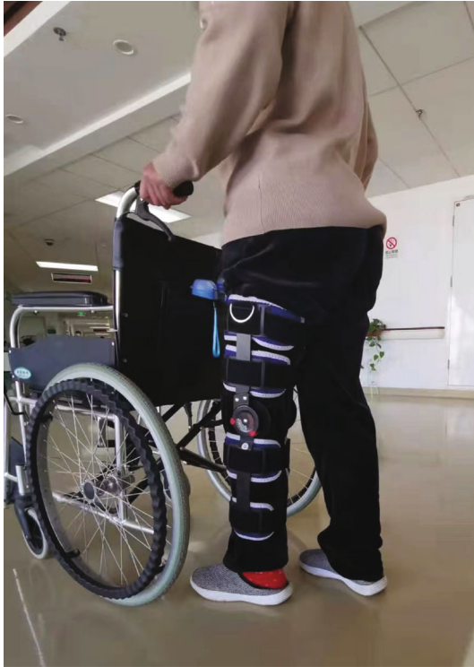
FIGURE 6: Walk with partial weight bearing under the protection of a hinged brace after the operation.