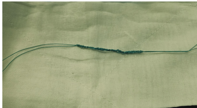
FIGURE 1: Braided tension line.