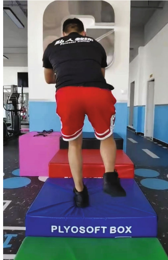
FIGURE 7: Balance training after the operation.

and the difference was not statistically significant ( P = 0.06 ) (Tables 5 and 6).