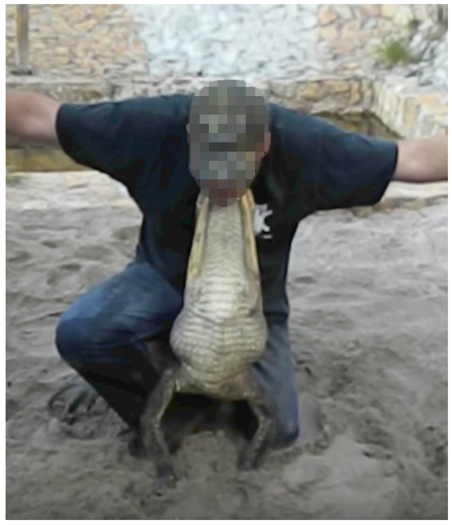
Fig 2. The "Bulldogging" stunt. Image captured from a video in the dataset.

https://doi.org/10.1371/journal.pone.0242106.g002