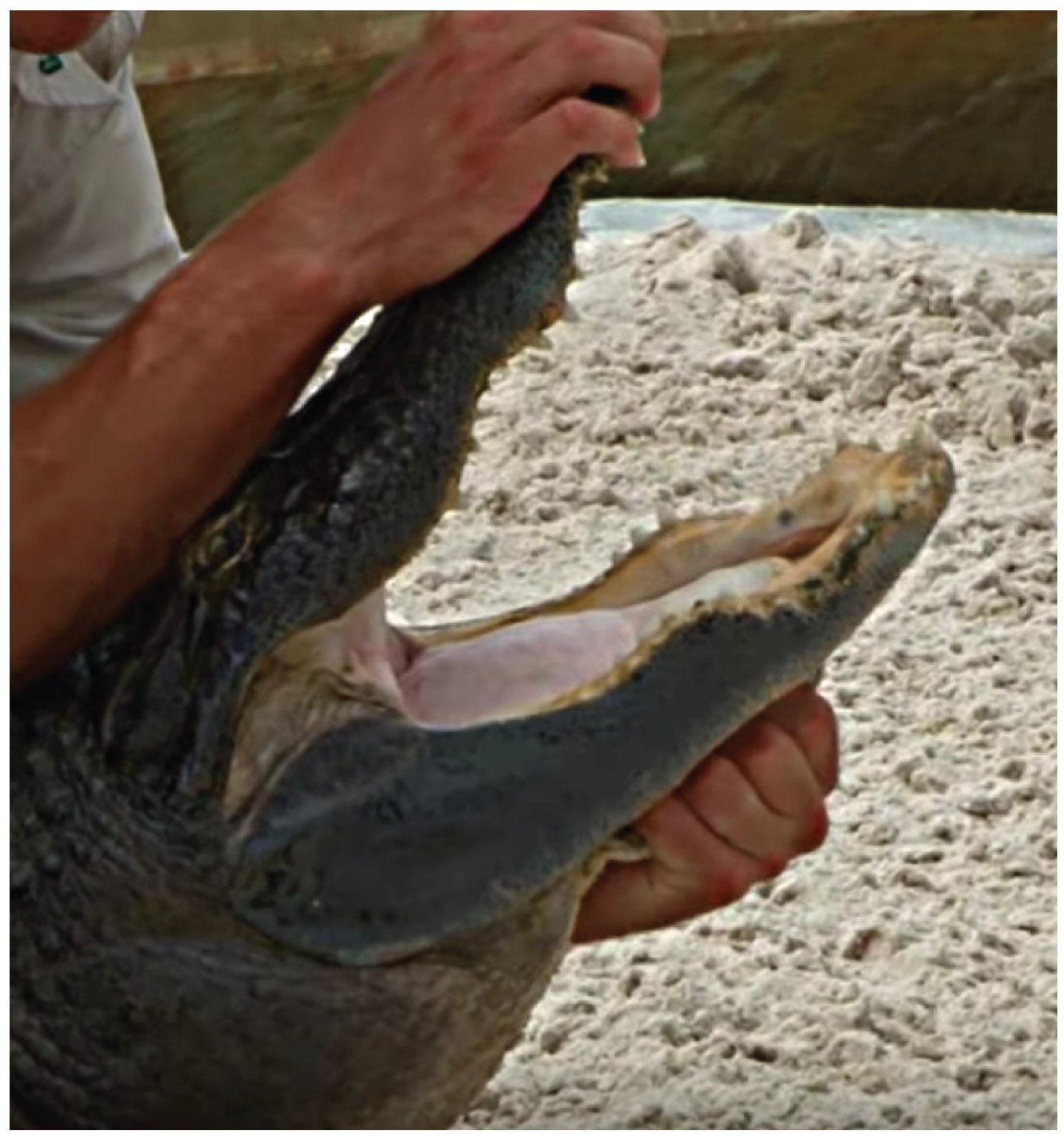
Fig 1. The "Florida Smile" stunt. Image captured from a video in the dataset.

https://doi.org/10.1371/journal.pone.0242106.g001