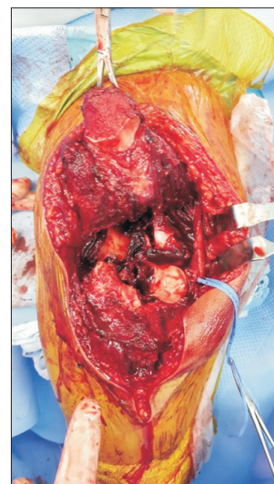
Fig. 2. Olecranon osteotomy.

While dual plate fixation is the essential principle in the treat-