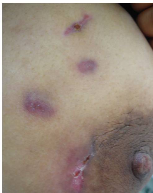
Figure 1 - There was discoloration of the overlying skin with multiple sinuses discharging fluid

A 26-year-old female patient presented with painful swelling, with multiple discharging sinuses of the right breast and a palpable lump in her right breast. According to the patient, the lump had been present for the past six to seven months, and the sinuses had developed recently (Fig-1). On physical examination, the right breast was very tender, and a diffuse, irregular mass was felt, mainly involving the lower quadrants. There overlying skin was discolored, with multiple sinuses discharging a dirty yellow fluid. The patient was treated with several nonspecific antibiotics by her family physician, but her breast symptoms remained the same. With