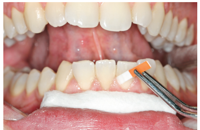
Figure 1 - Samples were collected from the vestibular face of lower central incisors and a lateral incisor (teeth #31, #41, #42).

The Statistical Package for Social Sciences v. 13.0 (SPSS Inc., Chicago, IL, USA) was used for data analysis. The normality of the sample was verified using the Shapiro-Wilk test; therefore, non-parametric tests were selected for analysis. Differences in the expression levels of each mediator over time were evaluated using the Friedman's test. When significant interactions were observed, a Bonferroni-corrected Wilcoxon paired signed-rank test was used to evaluate the significance of the difference between baseline and the other time points. A p-value of less than 0.05 was considered as statistically significant.