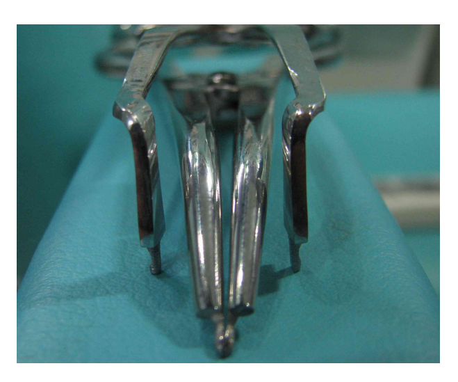
Figure 5 Comparing the beaks of a prototype rigid ring placement forceps with Palodent forceps.

increasing the chances of slippage. Ring separation forces are usually more when applied for ring removal after the restoration; the chances of ring slippage are higher during this part of the procedure.