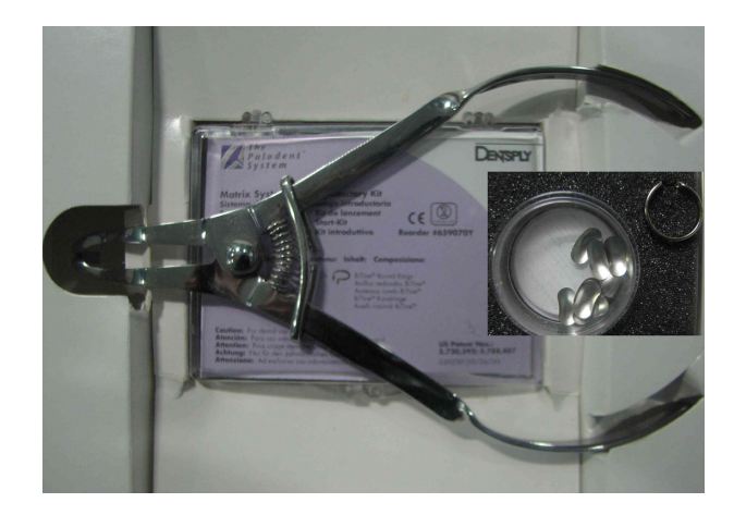
Figure 3 The Palodent forceps, matrix bands and the round ring kit.

of the ring is much higher than that of the forceps, there is maximum flexion at the bend present on the active beak side. Comparing the forceps with any rigid forceps, the difference is very apparent (Figure 5). The beaks are also thinner than those on other forceps. There is no bending or flexion of any rigid forceps (Figure 6). The instrument is very thin, although flat in design in an attempt to compensate for forces, which allows a lot of flexibility. Because of the flexion, the parallelism of the holding tines is lost and they slant towards the ring, providing an easy escape for the ring when under force.