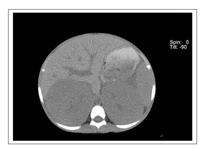
Figure 1. Bilateral homogeneous nephromegaly on CT scan. Non-contrast computed tomography (CT) scan showing bilateral homogeneous nephromegaly with no identifiable mass.

Percutaneous ultrasound guided fine needle aspirate cytopathology (FNAC) of the right kidney revealed lymphoglandular bodies, chromatin streaming and individual lymphoid cells with immature chromatin, nucleoli and scant dark blue vacuolated cytoplasm (Figure 2(a)). Bone marrow aspirate revealed 64.5% malignant lymphoid cells with blast-like chromatin, scant dark blue vacuolated cytoplasm. Cellularity could not be estimated due to lack of spicules. No megakaryocytes were seen. The myeloid-to-erythroid ratio was 1.7 (Figure 2(b)).