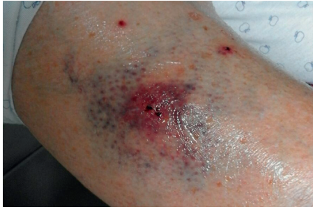
FIGURE 1: The cat bite on the right leg of the patient.