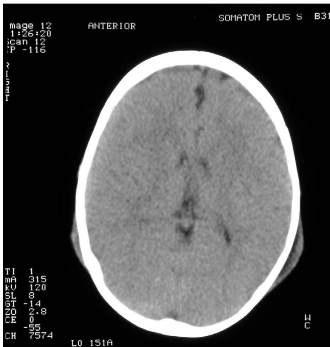
The girl: cranial computed tomography, done 7 hours after admission, showing cerebral oedema.